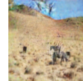
P_{0.5}(w, f) \rightarrow Q_{12}(w, f)