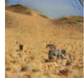
P_{0.5}(w) \rightarrow Q_{12}(w, f)